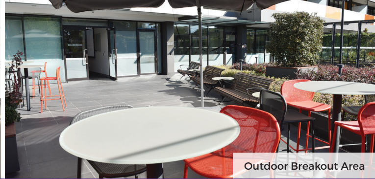
Outdoor Breakout Area