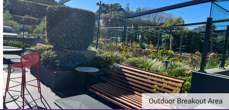
Outdoor Breakout Area